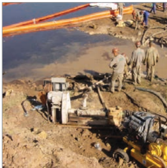
5. Seltorque S150 pump and skimmer operated by Alpina Briggs on an oil spill clean-up in Brazil.