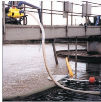
2. A PD75 Spate, in conjunction with an oil spill skimmer, operating as part of a clean-up operation.