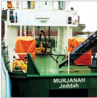
1. A deck mounted PD100 Spate fitted to a spill control catamaran for Saudi Aramco as a major part of its Red Sea oil spill response capability.