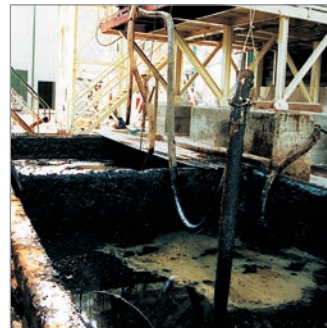
7. An S100 pump was installed to lift heavy viscous and contaminated material over 3m for transfer to a nearby separator plant.