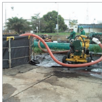
14. PD100s being used in Colombia to recover oil from a bund and transfer to fast tanks.