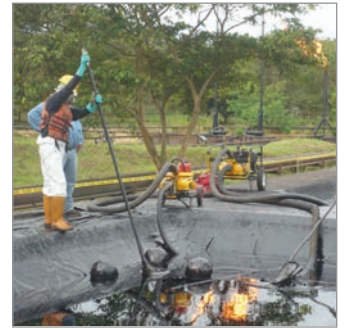
4. PD75s being used by Corena in Ecuador in conjunction with skimmers on API20 oil