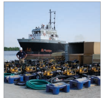
12. PD75s and skimmers being prepared for use on the Deepwater Horizon spill in the Gulf of Mexico.