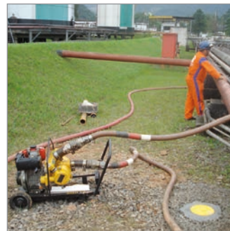
11. PD75 being used by Alpina Briggs to recover oil from a leaking pipeline.