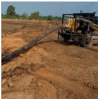
9. S200 being used to recover heavy oil from a waste oil pit in Venezuela.