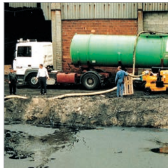
6. The waste product proved to be too heavy for the vacuum tanker to lift. An S150 pump filled the vacuum tankers in less than half the time.