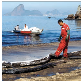
10. PD75 used in conjunction with a shore fence to recover floating oil in Rio-de-Janeiro, Brazil.