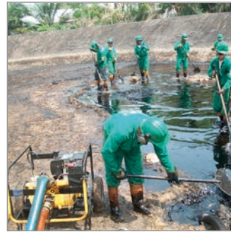
3. PD75s being used by Varichem de Colombia in response to a local oil spill.