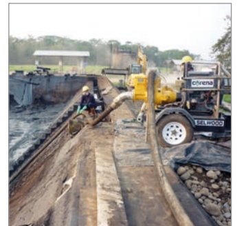
8. S150 being used by Corena to recover API20 oil from a deep pit