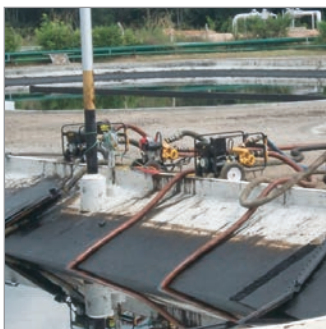
13. PD75s being used to drain a pit containing API20 oil in Colombia.